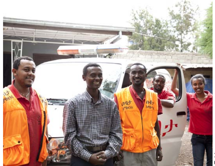
Tebita's ambulance team is prepared to serve Ethiopia

Many Ethiopians in need of emergency services cannot afford typical ambulance rates, which are often high due to substantial maintenance and fuel costs. However, Tebita finds limiting services to high-income patients to be unacceptable. Thus, the company is working to perfect a tiered-pricing and cross-subsidization model for their services. To subsidize services for the poor, Tebita pursues contracts with international organizations and multi-national companies. For instance, Tebita holds contracts with mining companies to provide emergency transport for employees located in harsh, rural settings. Tebita also partners with AMREF's Flying Doctors in Nairobi, International SOS, and Africa Assist to facilitate international evacuations, and works to provide other premium services that will attract